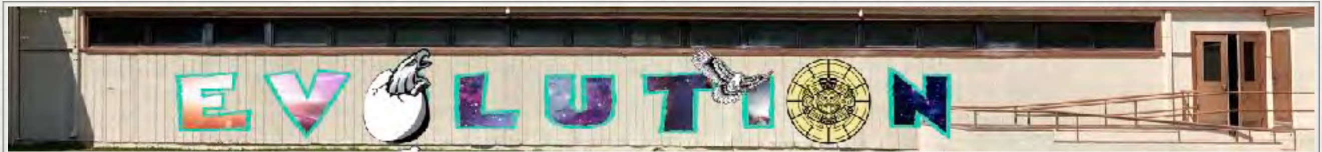
Flip it around, different background.....?