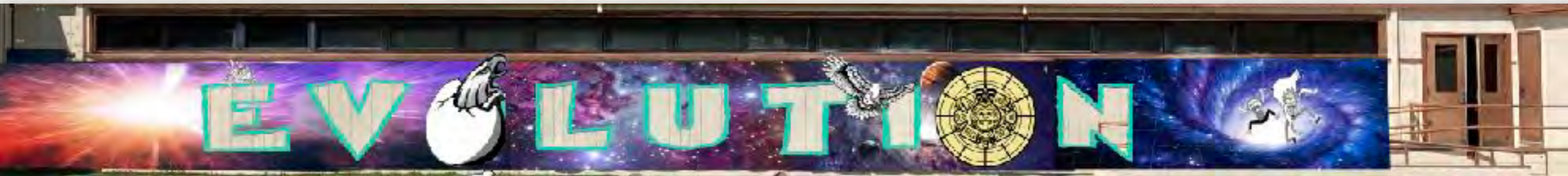
How the ideas work within the mural